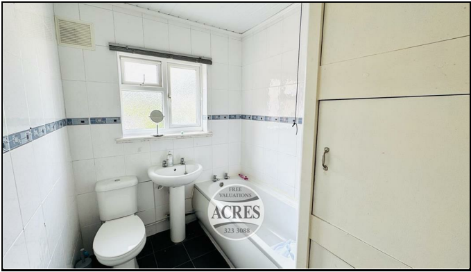
Hill Hook House, Clarence Road, Sutton Four Oaks, Sutton Coldfield